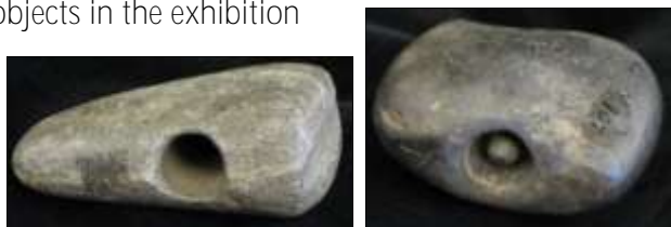
Atlatl Counterweights, ca. 2000 BC

Students puzzled through ideas, and finally, after drawing together everyone’s contributions, the group reached the answer—a piece of hollow river cane was twisted back and forth over a layer of sand to create the hole. The sand of the region consists predominantly of quartz, the second hardest rock, and using the hollow river cane only carved the perimeter of the hole, lessening the time and pressure needed to cut the stone. Following David Moore’s presentation, audience members looked at the objects in the exhibition with a new appreciation.