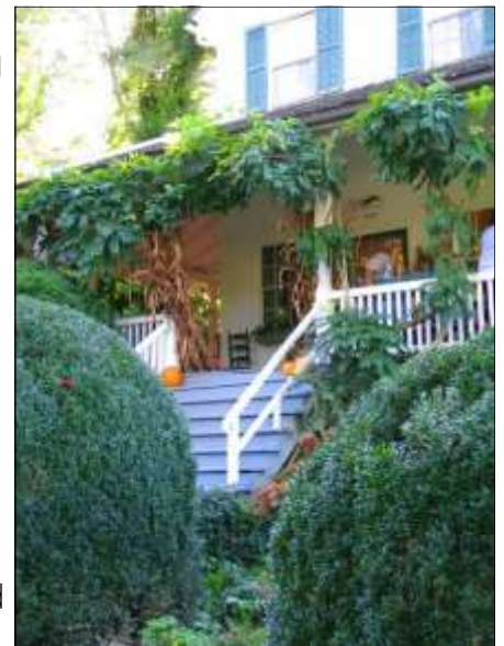
Hickory Nut Gap Farm.

Several people who had been involved with the Farmers Federation attended the event. These friends and family members reconnected and told stories, as guests dined on a bountiful meal and enjoyed the