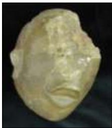
Jewel of the Ruskin Collection