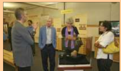
“Stories from These Stones” Exhibition.

Visit Our Exhibition: Liston B. Ramsey Center for Regional Studies, First Floor of Renfro Library Hours: Monday – Friday, 10 a.m. to 1 p.m.; Wednesday, 4 p.m. to 7 p.m., and by appointment, while school is in session.