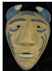
Gertrude Ruskin Collection