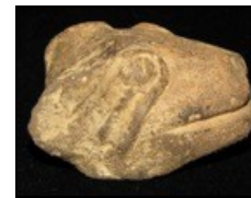
Gertrude Ruskin Collection

Funds raised for the Hart-Melvin Archival Research Fellowship count toward the National Endowment for the Humanities (NEH) Challenge Grant awarded to Mars Hill College's Liston B. Ramsey Center for Regional Studies for the Southern Appalachian Archives. One of the innovative programs featured during the bridging period of the NEH Challenge Grant is the use of faculty-student research teams. The Class of 1960, through its endowment of the Hart-Melvin Archival Research Fellowship, makes this successful program permanent.