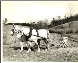
James G.K. McClure Farmers Federation Collection

The Southern Appalachian Archives, housed within the Liston B. Ramsey Center for Regional Studies at Mars Hill College, is home to collections with a national, and even international, reputation. The Ramsey Center is working hard to preserve these archival materials. Stewardship of such treasures is expensive, and Mars Hill College is very fortunate to have been awarded a prestigious National Endowment for the Humanities (NEH) Challenge Grant to create a permanent endowment that will support an archivist position and create a preservation and programming fund for the Southern Appalachian Archives. The NEH will give Mars Hill College the maximum award of $500,000, with the stipulation that the college raise $1.5 million in matching funds.