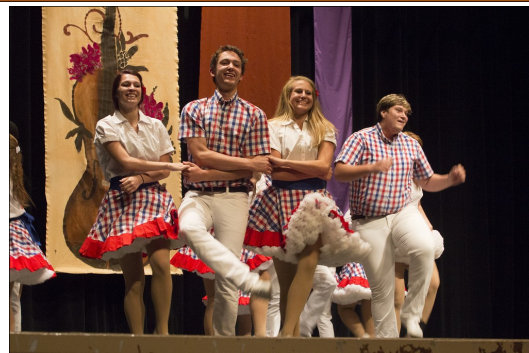
Bailey Mountain Cloggers, Lunsford Festival, 2013.

In recent years the Bailey Mountain Cloggers have worked closely with the Ramsey Center on several programs, including school group visits, our National Endowment for the Humanities Challenge Grant Celebration, and the annual Bascom Lamar Lunsford "Minstrel of Appalachia" Festival. This barn dance is another opportunity for partnership as we continue to strengthen and celebrate our shared history and commitment to the rich heritage of Madison County and the Southern Appalachian region. The dance will include square dances, big circle dances, alumni recognition, and an awards ceremony. East Tennessee State University's bluegrass band will provide live music for the called dances, the showcase of local