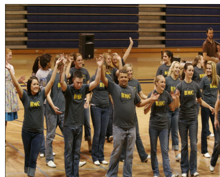
Performance at the NEH Challenge Grant Celebration, April 2012.