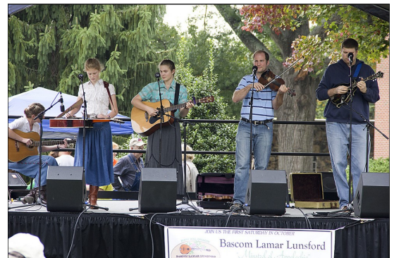
The Cockman Family and the Butterpats perform on the daytime stage.