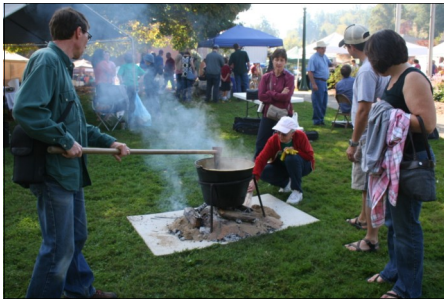
Making apple butter at the Lunsford Festival, 2013.