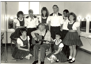
Bailey Mountain Cloggers with Doc Watson.

nationally showcasing and preserving Appalachian dance traditions. They have shared these traditions with fans in countries such as Germany, Ireland, Canada, Mexico, and Austria and throughout the United States. From early on, Mars Hill student cloggers blended the traditional with the modern, creating memorable performances for their audiences. Their success is reflected in the precision with which they perform; their deep understanding of traditional dances; their enthusiasm for innovation; and the ear-to-ear smiles of audience members who come out to see them.