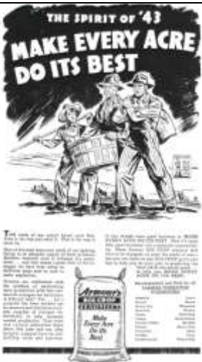
Advertisement from the Farmers Federation News.